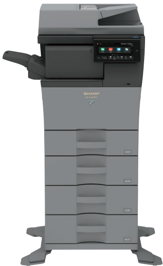
BP-C545WD shown with Inner Finishing Unit in a 4-drawer configuration.